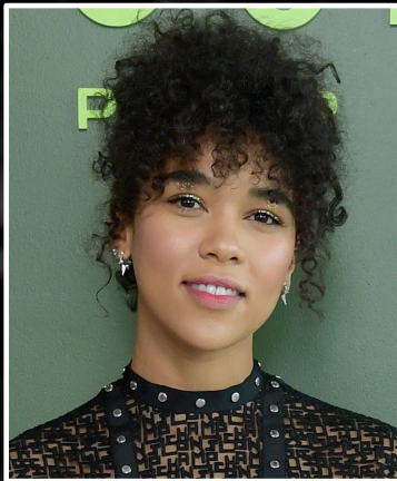
ALEXANDRA SHIPP AS ALEXANDRA "LEX" WALTERS