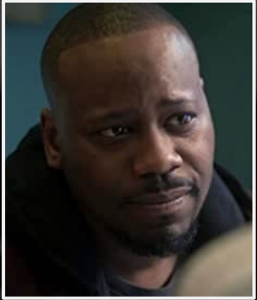
MALCOLM BARRETT AS JAMES "MIRRORS" MCGUIRRE