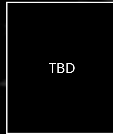
AGENT HILL STILL TO BE CAST