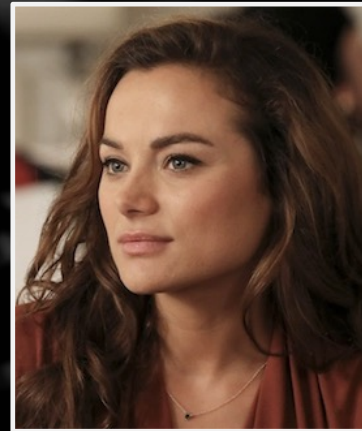
CHRISTINA OCHOA AS JESSICA "JESSE" MORALES