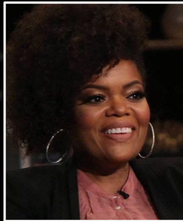
YVETTE NICOLE BROWN AS WENDY GREENE