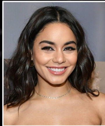
VANESSA HUDGENS AS CASSANDRA "CASSIE" CLARK